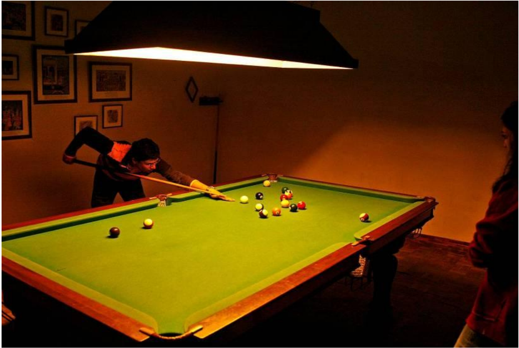
Activity Room- Pool Table