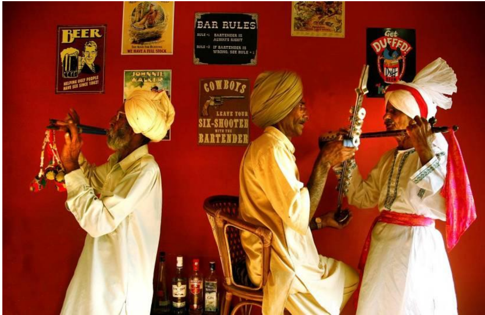
Watering Hole- Bar