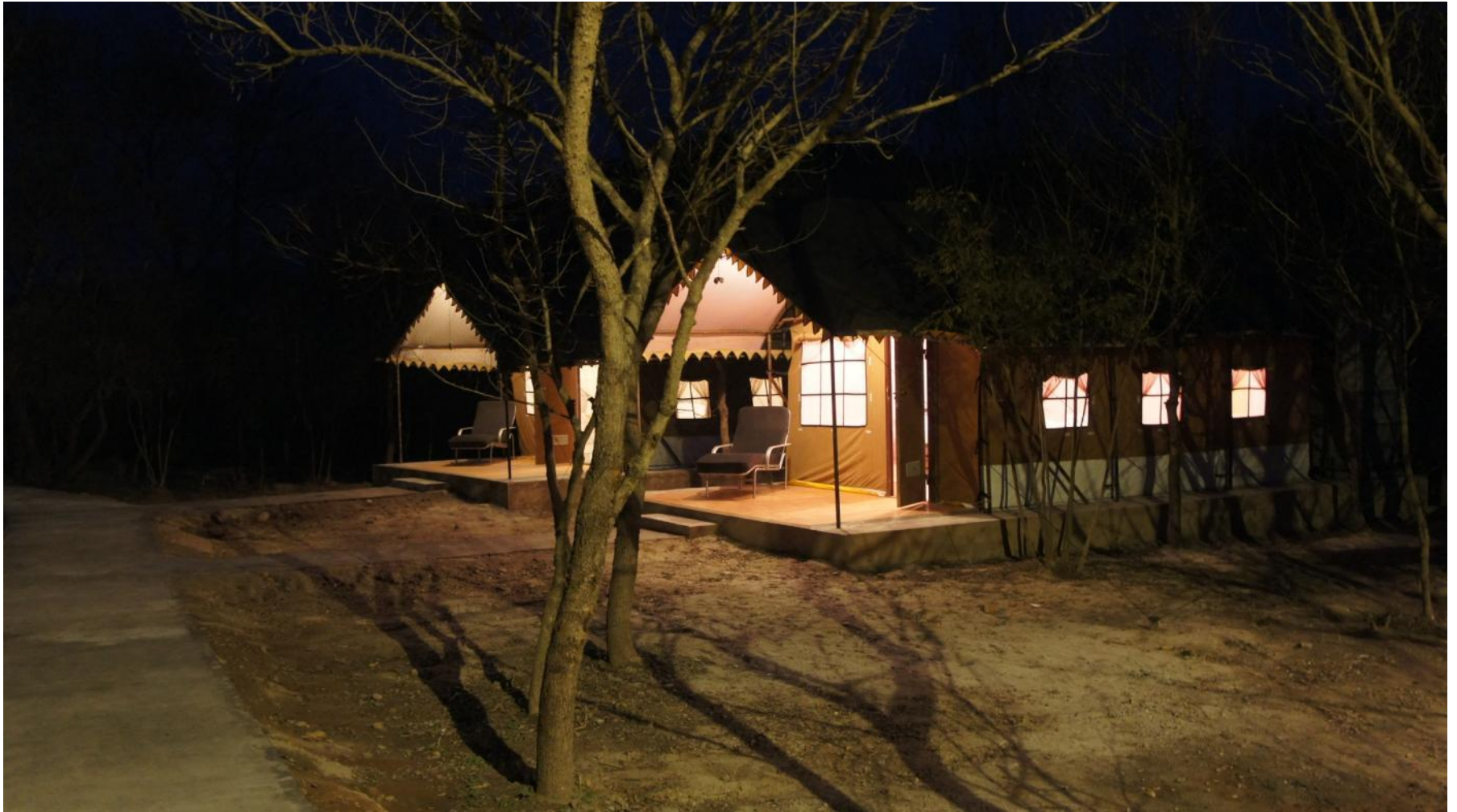
Luxury Safari Tents