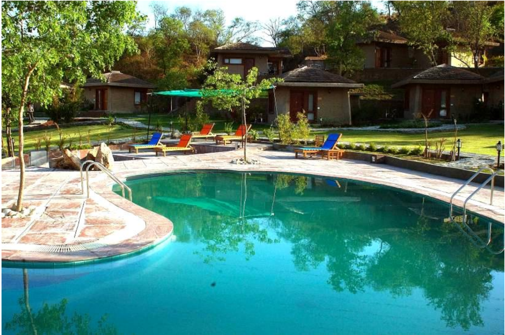
Eight - Pool View Cottages