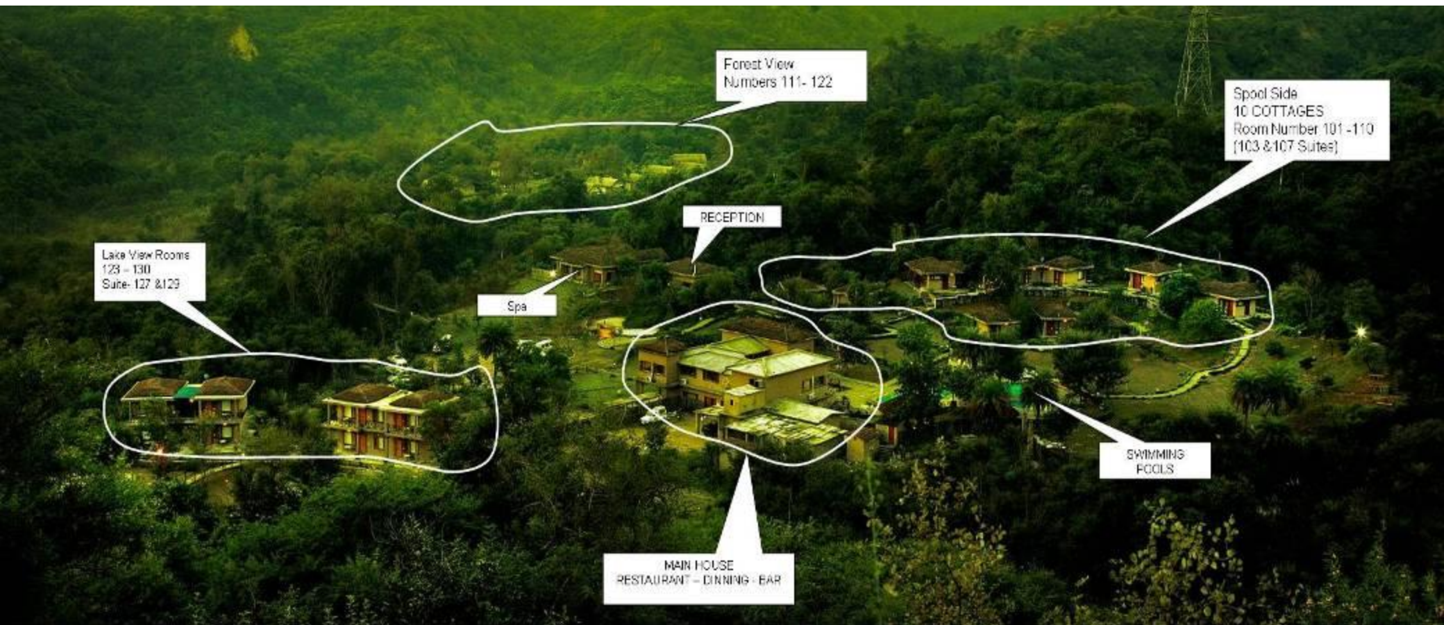
Kikar lodge layout