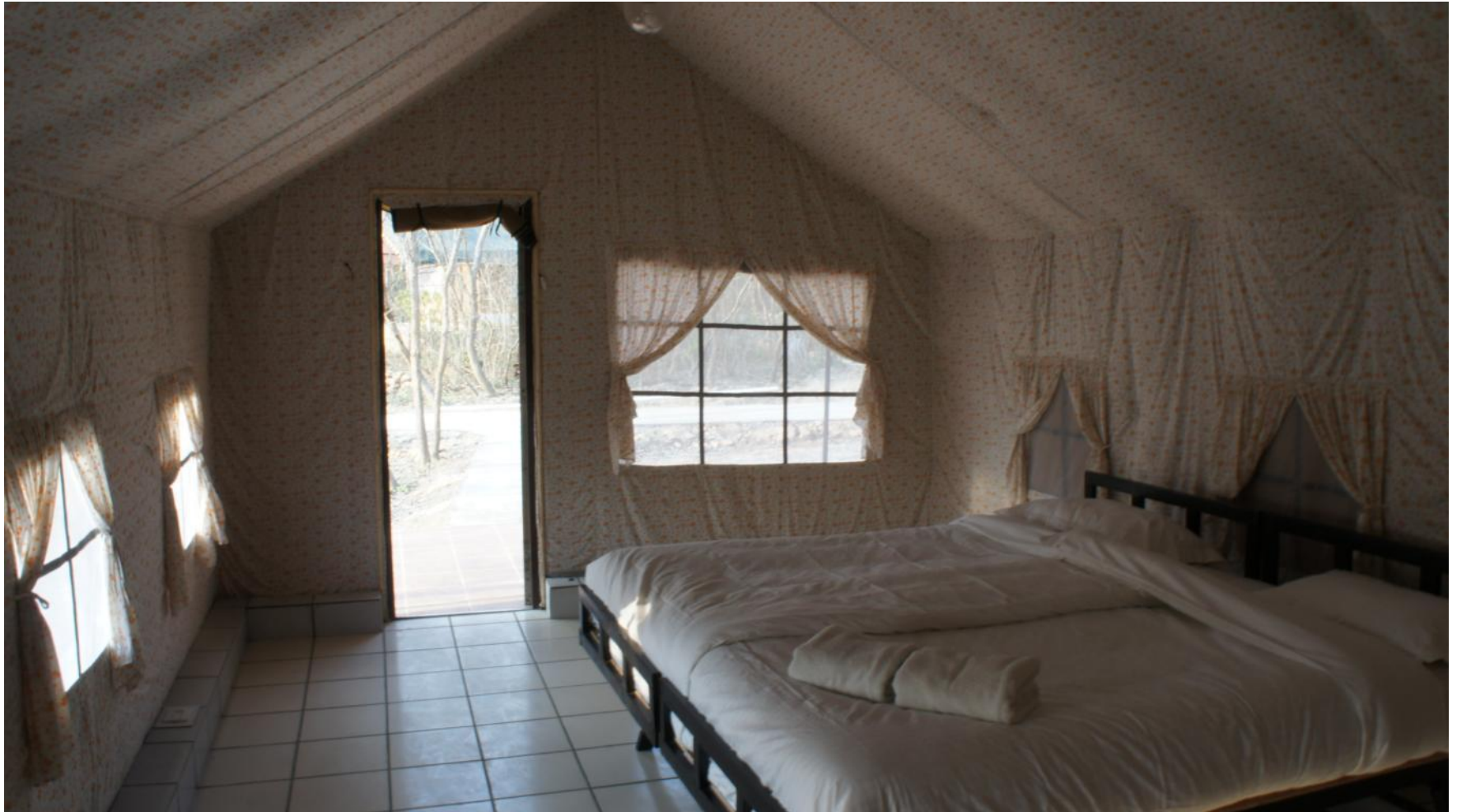
Luxury Safari Tents