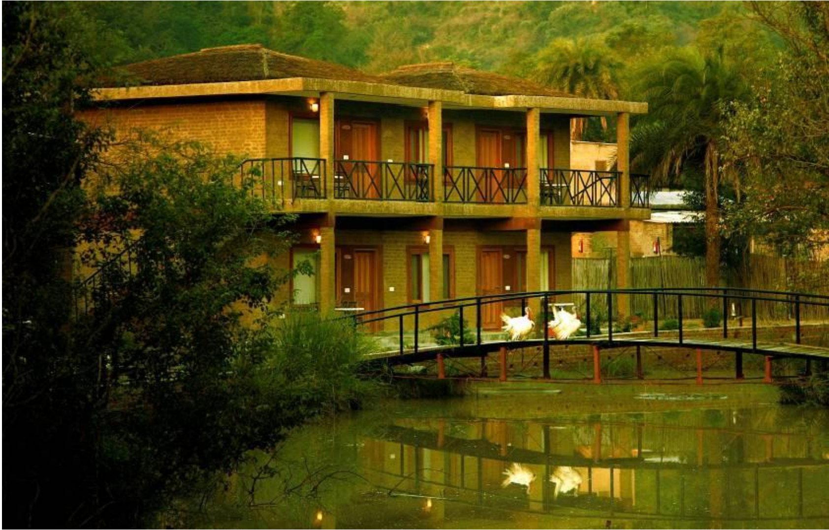
Six Deluxe Rooms