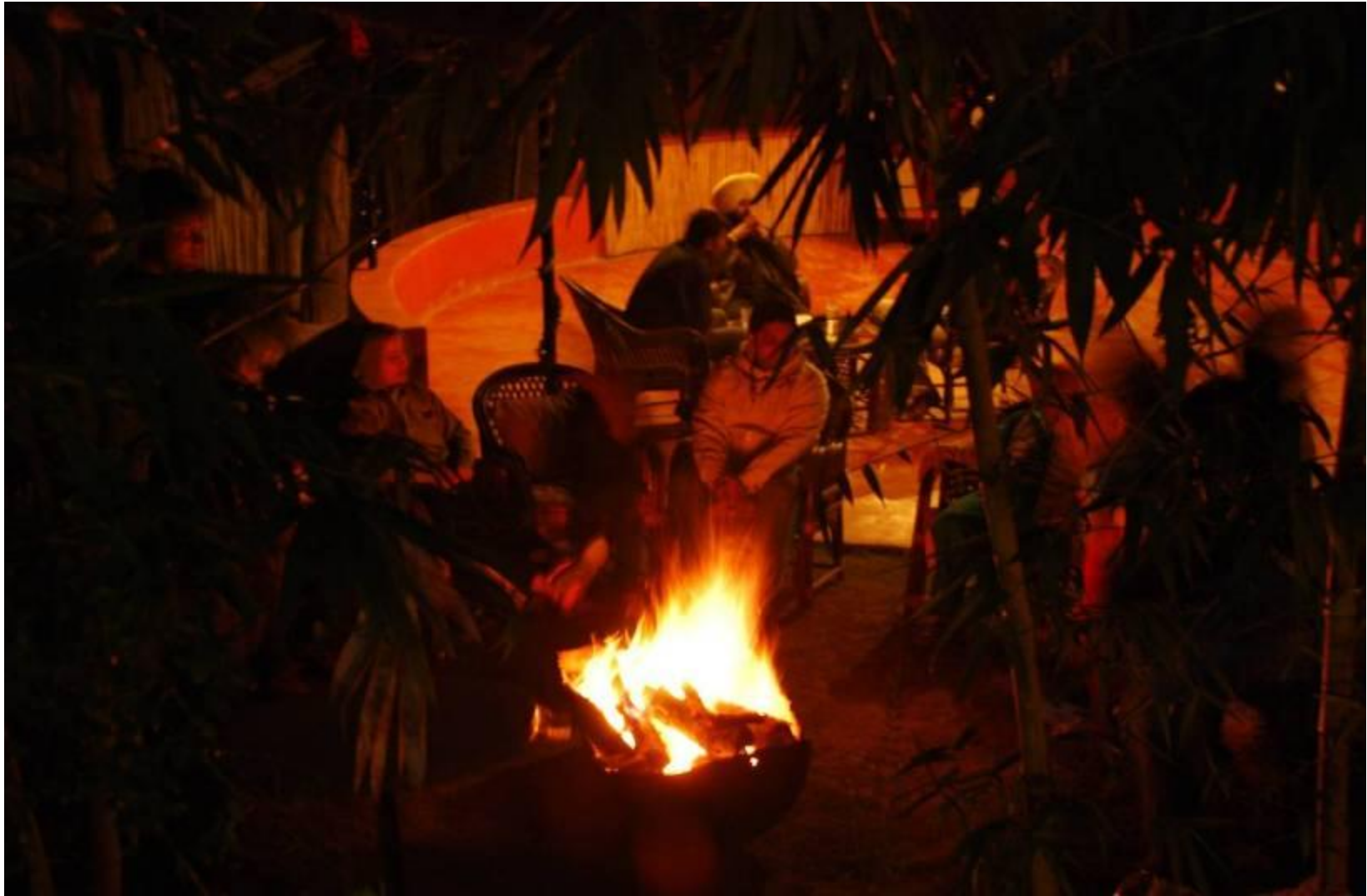
Cold Nights- Bon Fire