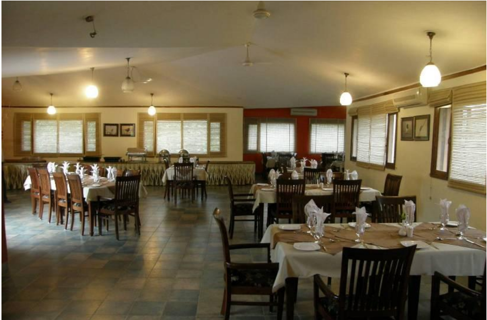
Pheasants Nest- Multi Cuisine Restaurant