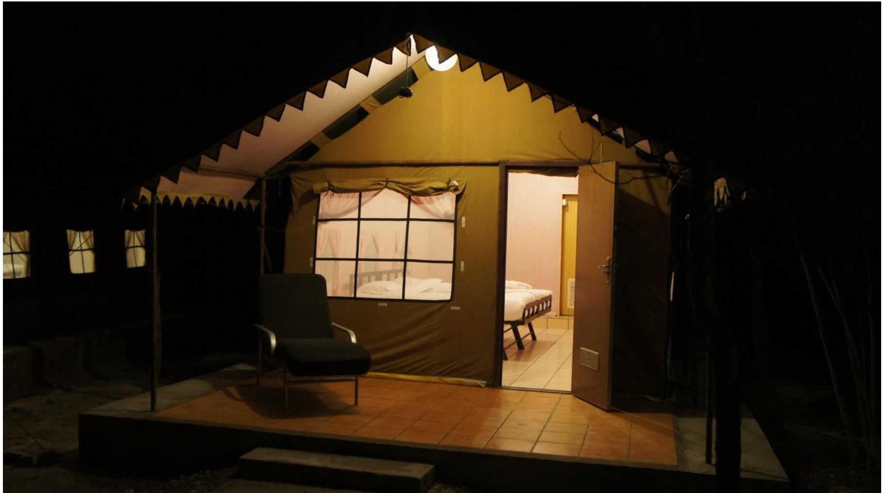
Luxury Safari Tent Interior