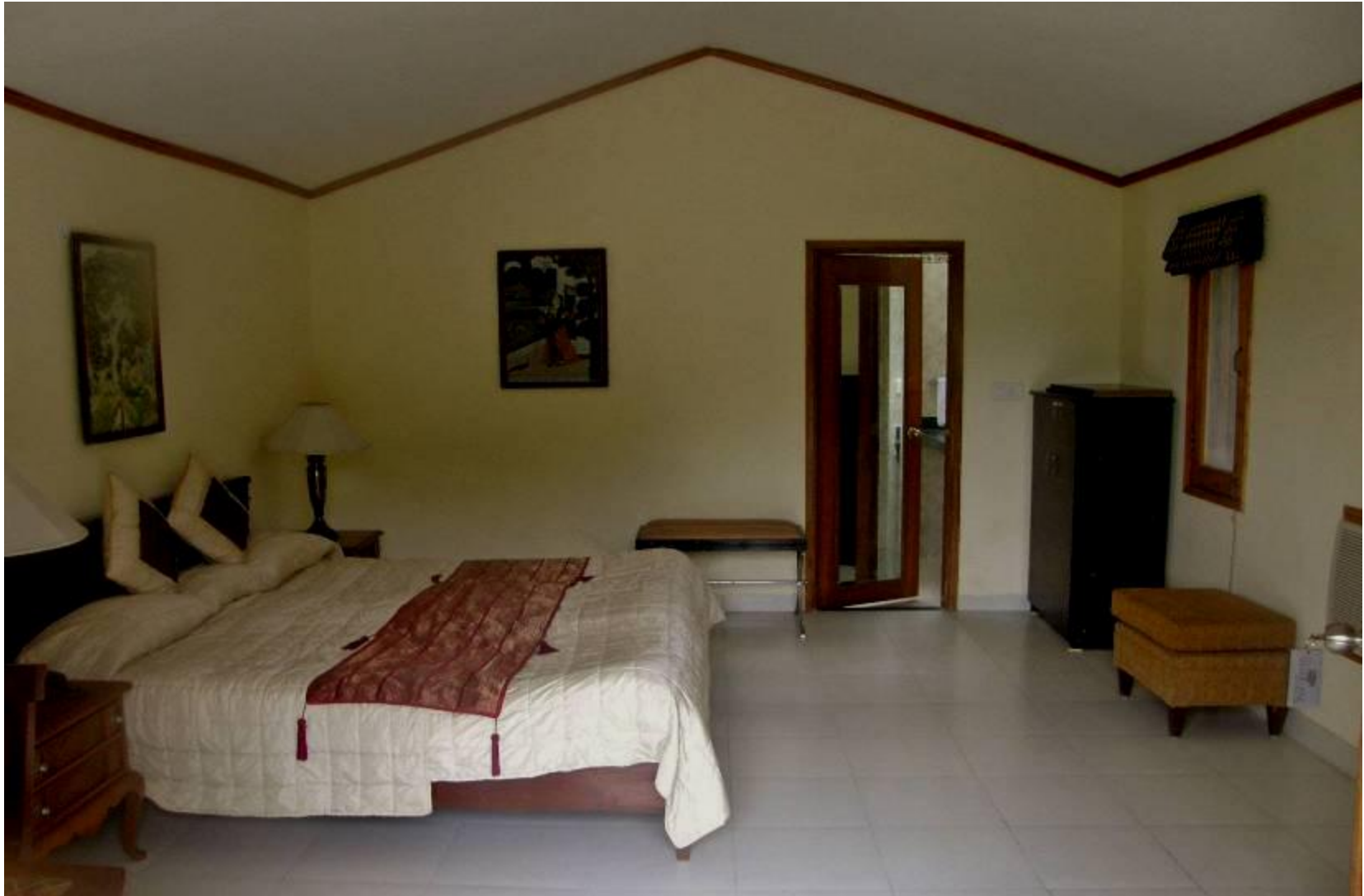
Forest View Cottage Interior