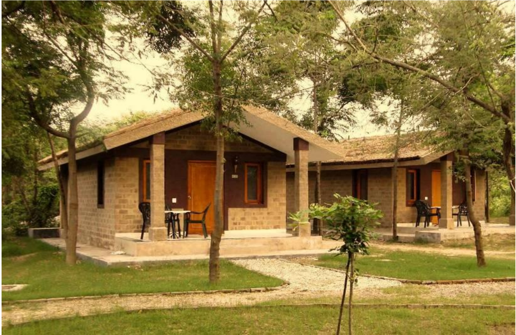
Forest View Cottages